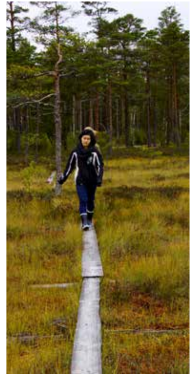
Find the hidden secret in Southwest Finland coastal area